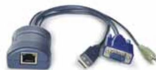
Example CAM: CATX-USB-A

CAM: Computer Access Module PS/2 only: CATX-PS2 PS/2 plus audio: CATX-PS2-A USB only: CATX-USB USB plus audio: CATX-USB-A Sun plus audio: CATX-SUNA Single Rack Kit: RMK-ALIP Dual Rack Kit: RMK-ALIP-Dual Serial upgrade cable: CAB-9M/9F-2M Slave power switch for connection to AdderView CATxIP 1000 or master power switch: PSU-8SLAVE Master power switch for connection to AdderView CATxIP 1000 or standalone Ethernet operation: PSU-8MASTER